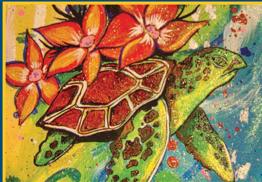
Artwork by Kairos youth & young adults | Design by Michaels & Michaels Creative