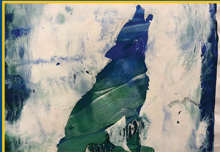
Artwork by Kairos youth & young adults