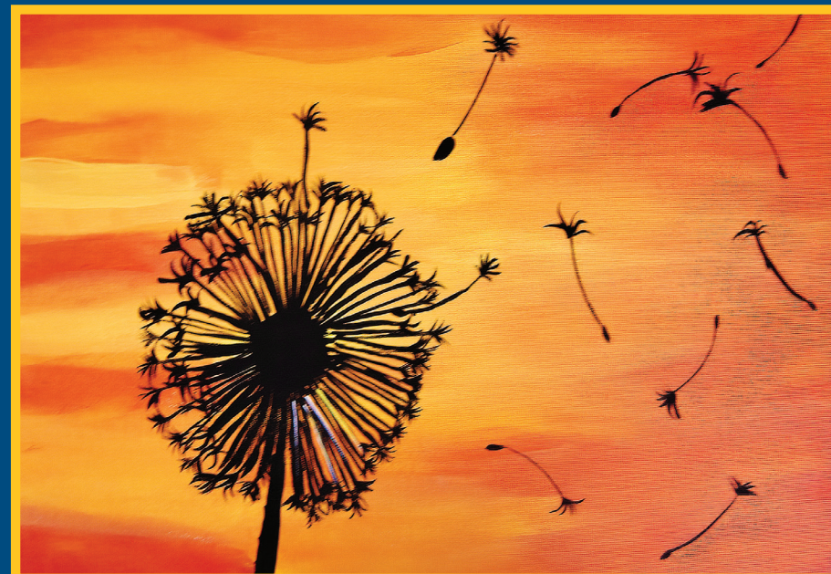
Artwork by Kairos youth & young adults | Design by Michaels & Michaels Creative